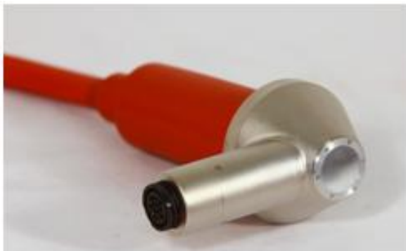
OEM or for replacement only