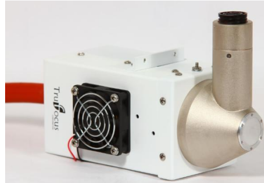
Packaged in a metal housing with FAN